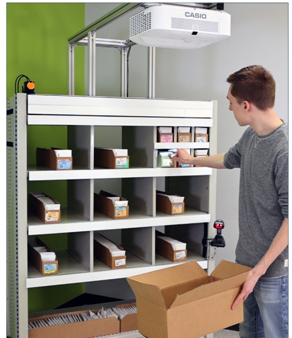
Projection picking showing laser projector and LIDAR remote sensor