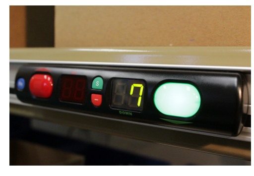
MW2040PRG-22: 2x2-Digit Display, Red/Green Domed LED Light/Confirm Button for Dual Location Applications