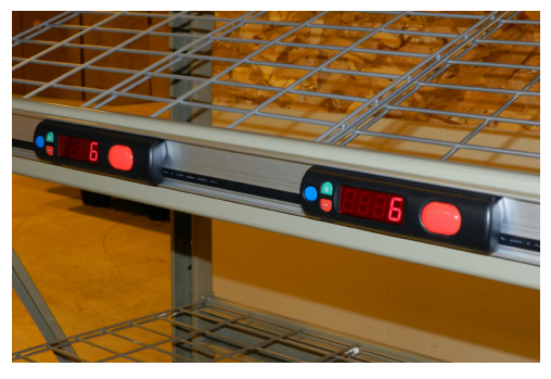
Flexible, Easy and Durable Duct System

The high performance MW Series provides a clear and advantageous hardware upgrade path for current Lightning Pick customers, including Pick-MAX hardware.