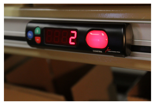
MW2040PR: 4-Digit Display, Red Domed LED Light/Confirm Button