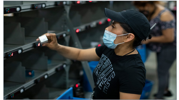
Lights are associated with sort locations that correspond to individual orders.

Matthews Automation Solutions' best-of-breed product for light-directed technologies, Lightning Pick, is the number one installed pick-to-light system in North America. Our pick-to-light, put-to-light, pack-to-light, pick carts and other solutions optimize material handling processes — from manufacturing through order fulfillment.