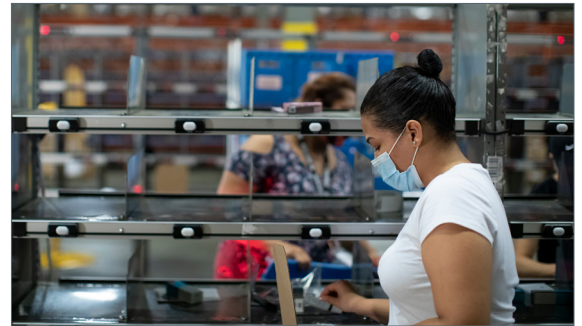
Two-sided put wall for sorting and packing.