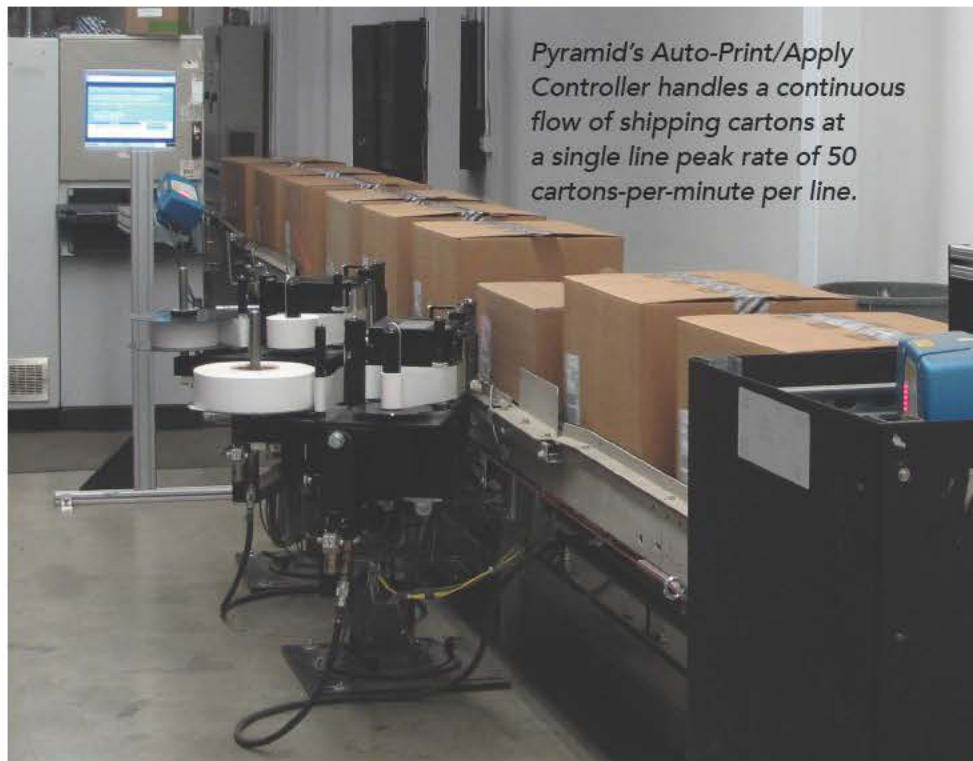
Pyramid's Auto-Print/Apply Controller handles a continuous flow of shipping cartons at a single line peak rate of 50 cartons-per-minute per line.