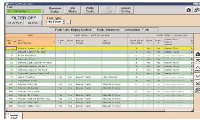
Director WCS supports various configuration options to meet the specific needs and requirements of each application.